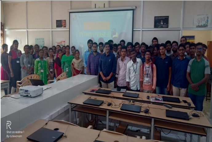
Three day Workshop on “Python” Phase-II in association with APSSDC for III Year CSE students