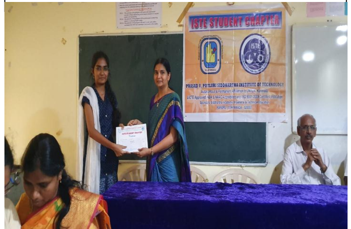
I Prize winner in Elocution at Engineers' day celebrations-2019