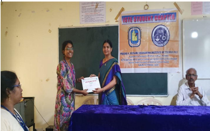
II Prize winner in Elocution at Engineers' day celebrations-2019