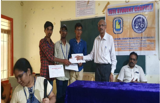
II Prize winners in Technical Quiz at Engineers' day celebrations-2019