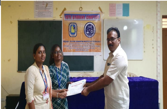
III Prize winners in PPT at Engineers' day celebrations-2019