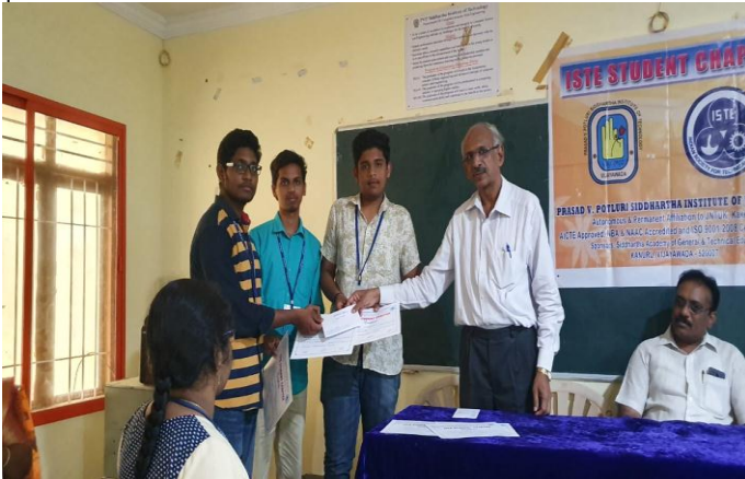
I Prize winners in Technical Quiz at Engineers' day celebrations-2019