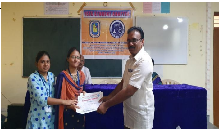
I Prize winners in PPT at Engineers' day celebrations-2019